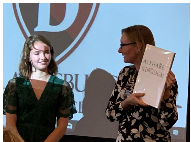
Scholarships - 2019