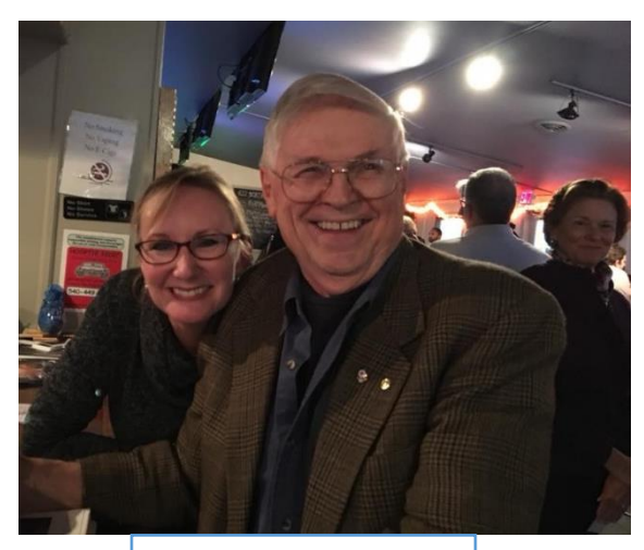
Pints for Polio - 2017