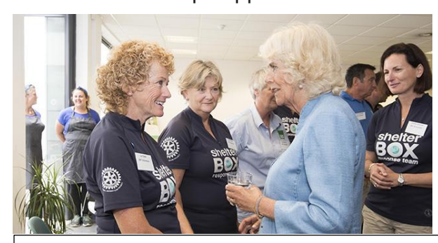
ShelterBox and Rotary meets HRH, the Duchess of Cornwall

support, ShelterBox can be ready to respond, providing displaced families with the lifesaving aid they need right when they need it most. Each box is tailored to a disaster but typically contains a disaster relief tent for a family, thermal blankets and groundsheets, water storage and purification equipment, solar lamps, cooking utensils, a